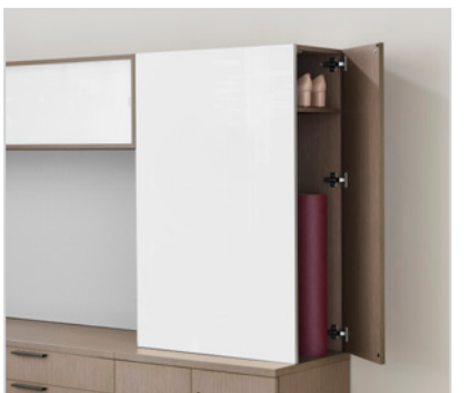
Side Facing Hutch