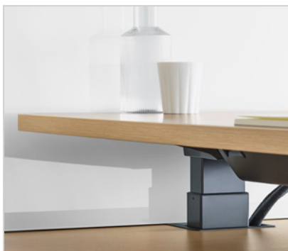
Height Adjustable Leg Integration