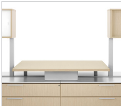
Team Bridge Surface