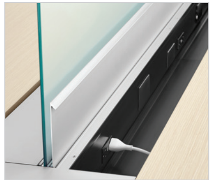
Beam Power / Data Channel