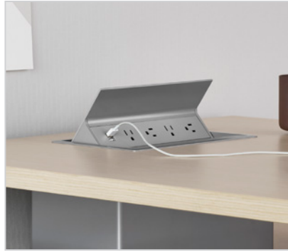
Power Access Credenza